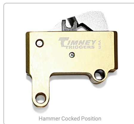
Hammer Cocked Position