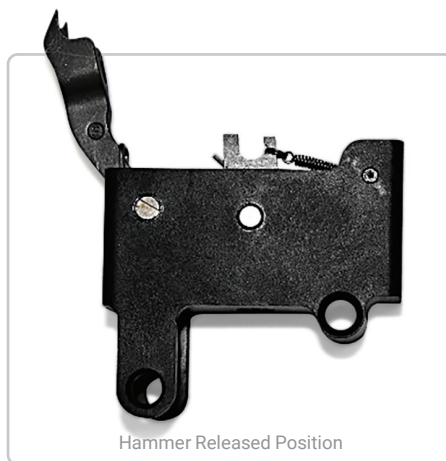
Hammer Released Position