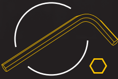
5/64" Hex Wrench