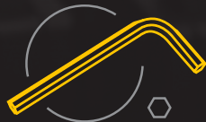
.05 hex wrench