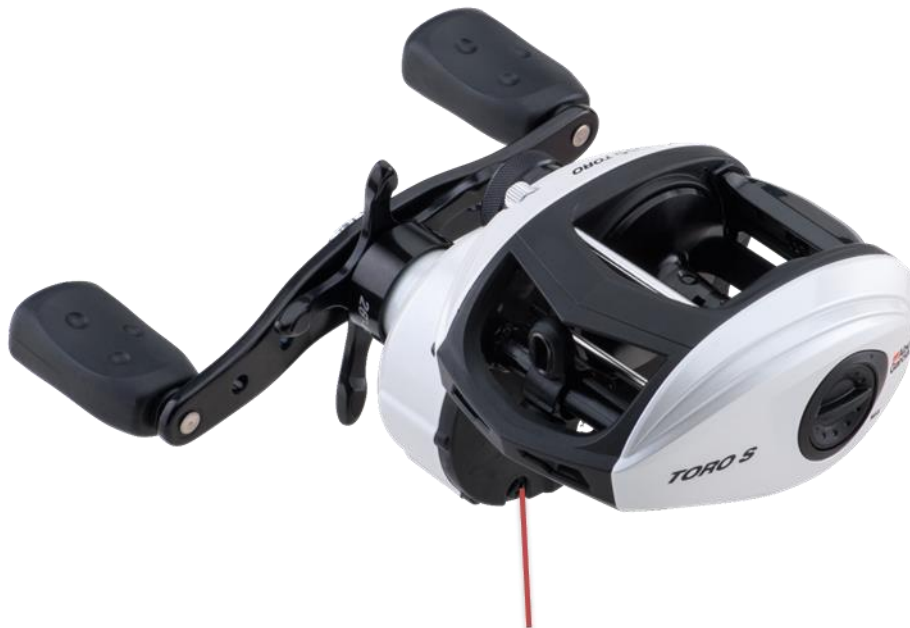
Maintenance Port Screw

the spool with your thumb. If you don't stop the spool as the lure hits the water, the spool will continue to rotate causing a backlash (a.k.a bird's nest )